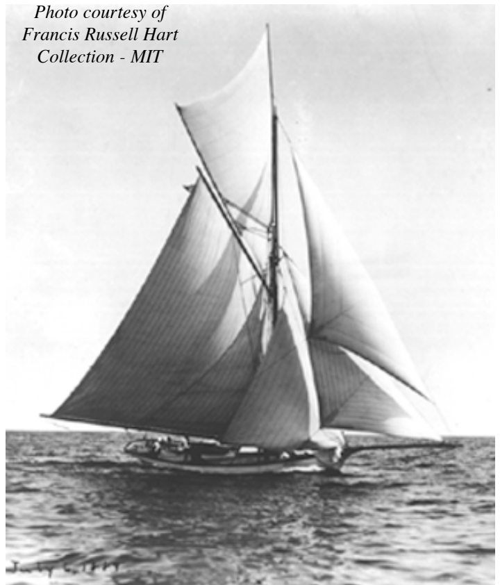
Photo shows Elf's original massive rig that she will soon carry again.