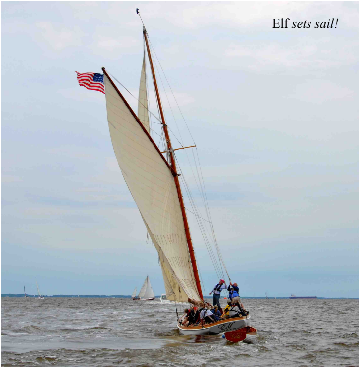
Elf sets sail!