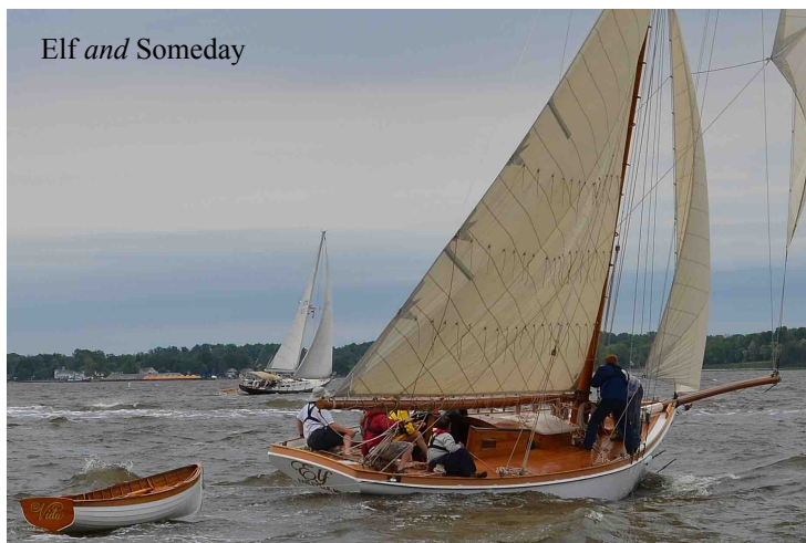
Elf and Someday

For more information about the Classic Yacht Restoration Guild, the historic yacht Elf and the Classic Race, go to www.cyrg.org .