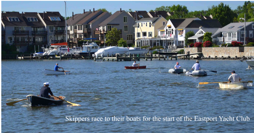
Skippers race to their boats for the start of the Eastport Yacht Club

For the last six years, the Elf Classic has begun when skippers gather their vessels off Eastport Yacht Club in Annapolis and drop anchor. They then nimbly climb into their respective dinghies and row to the clubhouse for a morning cup of coffee, some polite banter and pre-race instructions. While the captains are sipping a second cup ashore their crews ready the sails, watch the breeze and check incoming tide and weather patterns.